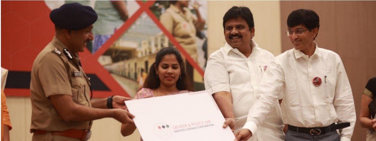
Launch of the Gender and Policy Lab Logo

The dignitaries of the event collectively launched the logo of the Gender and Policy Lab. The three triangles of the logo signify the female, male and diverse genders while the circles placed above indicate balance and mainstreaming. The larger outer circle of the logo signifies mobility and freedom of movement in the city. Following this, the dignitaries also released the bilingual (Tamil and English) Annual Reports of the Gender and Policy Lab which is a compendium of the Lab's works over the past year.